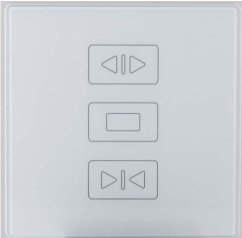
R35-1 front panel, showing 3 soft touch buttons for Open, Stop & Close functions from top to bottom.

Built with RF technology, the R35 Wireless Wall Control Unit is designed for 1 channel (R35-1) or 2 channels (R35-2).