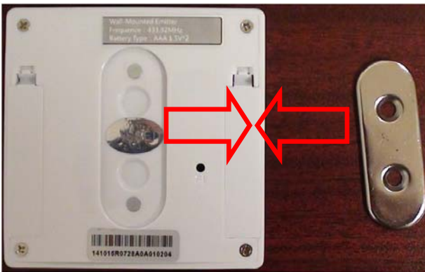
With the attached metal plate mounted, the R35 unit could be affixed to it by magnetism to any surface, like a wall or a furniture, etc.