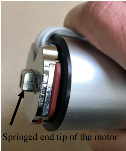
Springed end tip of the motor

To attach the bracket & the motor together, as the picture indicates, hand hold the tubular motor's power cord backward, in order not to have it contact the bracket. Pushing the bracket too hard could cut or damage the power cord.